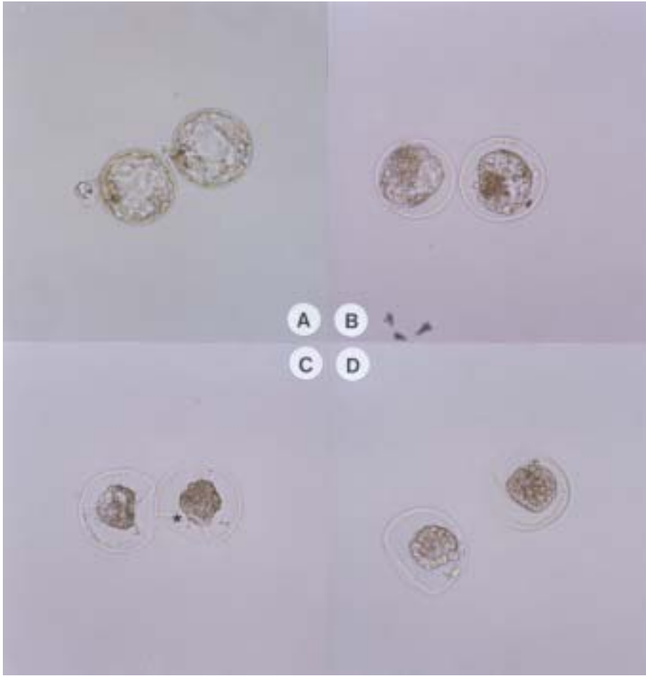
Figure 1. A series course of vitrification of human blastocysts using EM grid ( \times 100 ). Human expanded blastocyst (A) were equilibrated in EG20 for 3 min (B). Shrank embryos (C) after physical puncture using 36G needle (*; C) were equilibrated in EG20 (D) for 1.5 min.

14 Vajta . Vajta OPS 90% 15 Chen plastic straw , OPS plastic straw , EFS , 16 OPS , Kong OPS glass mi- cropipette 17 74~89% 6,12 plastic straw 13 , plastic straw straw plastic straw , straw OPS , OPS Niemann 가 EM grid Martino , straw EM grid 7 9,10 Park plastic EM grid EM grid